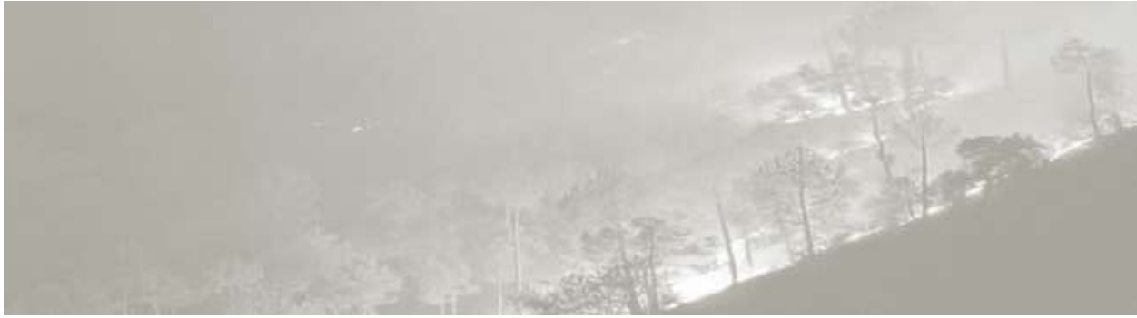
Fig. 2: Forest Fire in Uttarakhand

Thus dry weather, low seasonal rain and vapour pressure deficit followed by burning of pine needles, burning of litter and shading of plants by local people and unsustainable forest conservation policy are all responsible for forest fire in Uttarakhand.